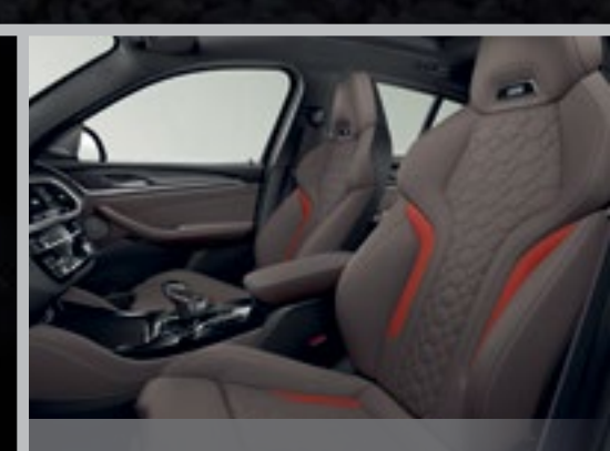
M Sport Seats for Driver and Front Passenger