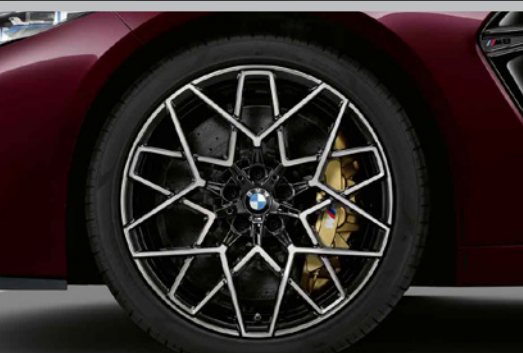
M Compound Brake System