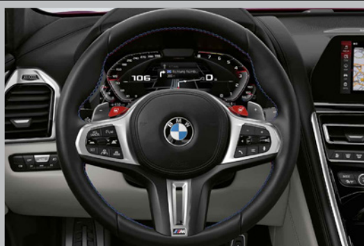
M Leather Steering Wheel with Multifunction Buttons and M Steptronic Transmission with Drivelogic with Gearshift Paddles (8-Speed)