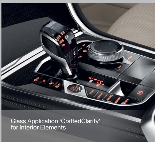
Glass Application 'CraftedClarity' for Interior Elements