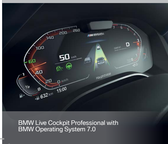
BMW Live Cockpit Professional with BMW Operating System 7.0