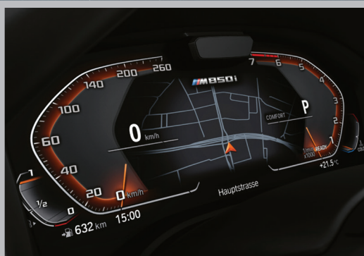
BMW Live Cockpit Professional