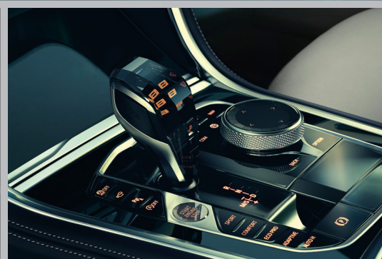
Glass application 'CraftedClarity'