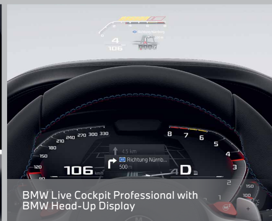
BMW Live Cockpit Professional with BMW Head-Up Display