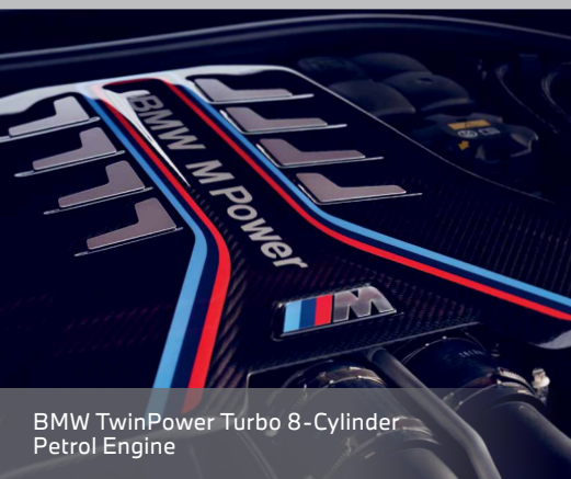
BMW TwinPower Turbo 8-Cylinder Petrol Engine